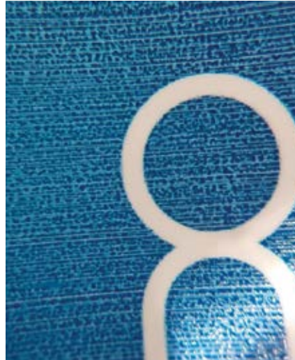
Print quality – good vs poor wetting on substrate.

barcodes or text information in the same line. In addition, space needs to be allowed for multiple barcodes to be printed.