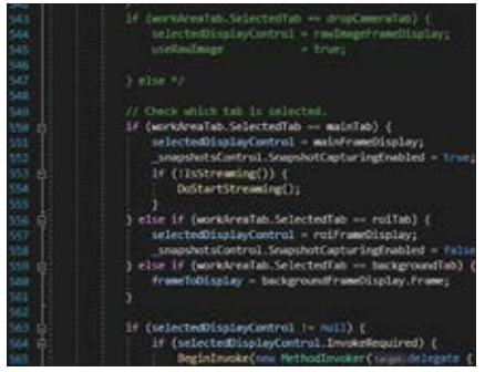
A snippet of FPGA code