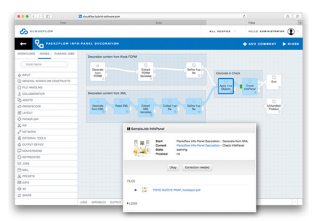
Cloudflow - Workflow Editor - create custom workflows

larger quantity of smaller orders, with the same number of employees and equipment. This requires a new breed of automation tools.